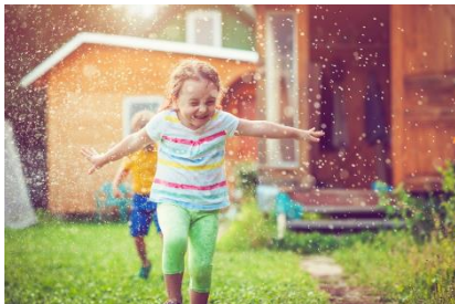
Children 0-18 years of age