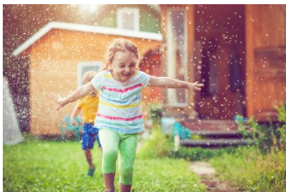
Children 0-18 years of age