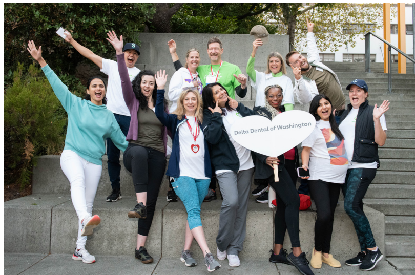
Delta Dental team at 2022 Heart and Stroke Walk.

Second Harvest - supporting food banks, meal sites and other programs feeding people in need in Eastern Washington