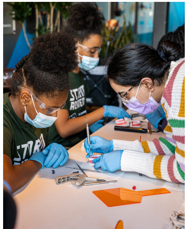
Seattle Storm Academy.