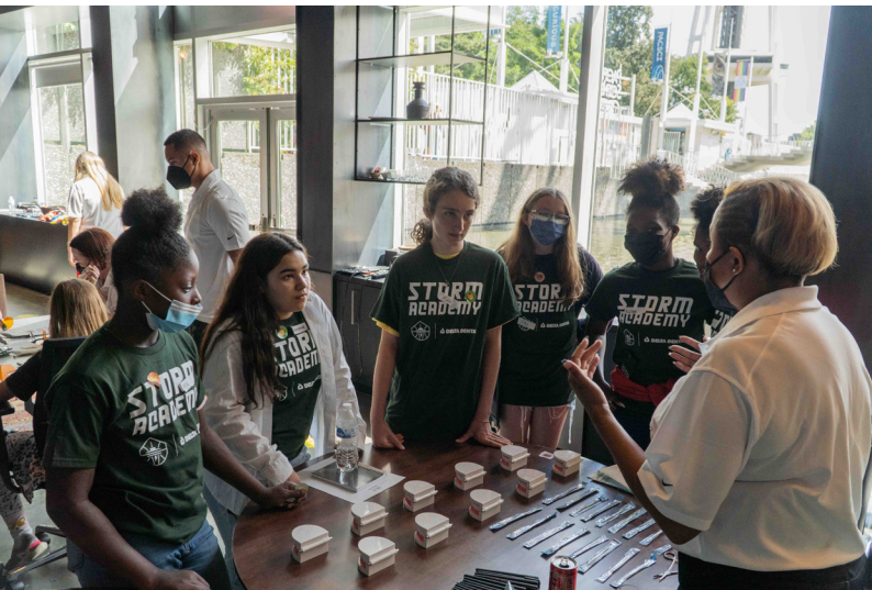
Inspiring girls to consider dentistry at Seattle Storm Academy.

We are optimistic that some of these youth will be inspired to pursue dental careers in Washington.